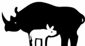
Species Survival Plan